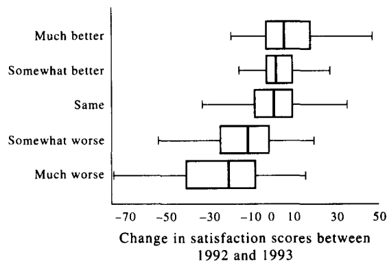
Fig. 2. Opinion on change in quality of care between 1992 and 1993, and difference in satisfaction scores measured in 1992 and in 1993, among 583 persons who participated in both surveys. Box-plots indicate the median (central bar), the 25th and 75th percentiles (edges of the box) and the maximum and minimum values (lateral "whiskers").

As expected, internal consistency coefficients were higher for longer scales than for scales consisting of only 2 or 4 items. Internal consistency coefficients for the "access" and "insurance services" scales may have seriously underestimated scale reliability, because individual items tapped very distinct aspects of the underlying dimensions. The correlation between the 2 items measuring insurance ser-